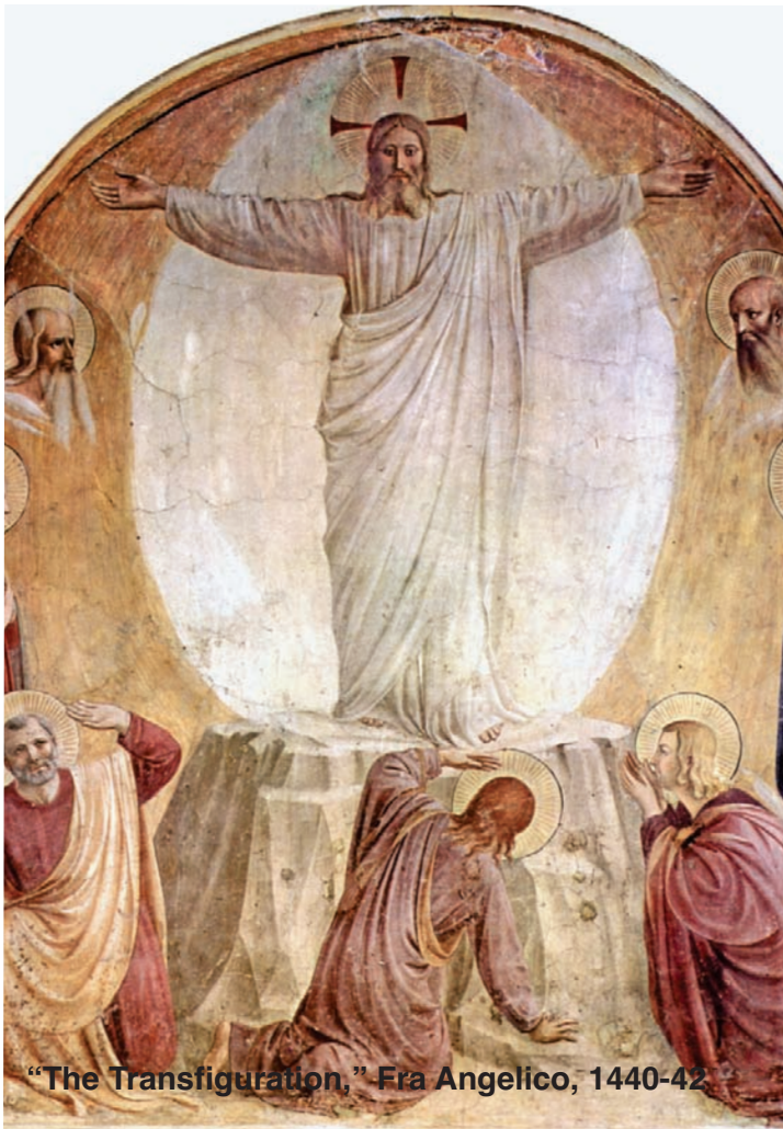
"The Transfiguration," Fra Angelico, 1440-42

St Basil's Parish was founded in 1856 by the Priests of the Congregation of St. Basil, also known as the Basilian Fathers. We are the collegiate church of the University of St. Michael's College at the University of Toronto, as well as being the parish church to our parishioners who come to worship here from all